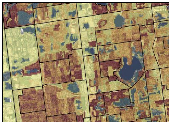
A dasymetric population map for several census blocks in Tampa Bay, FL. A single census block may have pixels that are non-habitable, as indicated in blue, as well as a range of low, medium, and high-density land cover types indicated in shades of red—the darker the pixel, the greater the population density.

Dasymetric mapping is a geospatial technique to more accurately distribute data that has been assigned to arbitrary boundaries, such as census blocks, using additional information such as land cover. Using the National Land